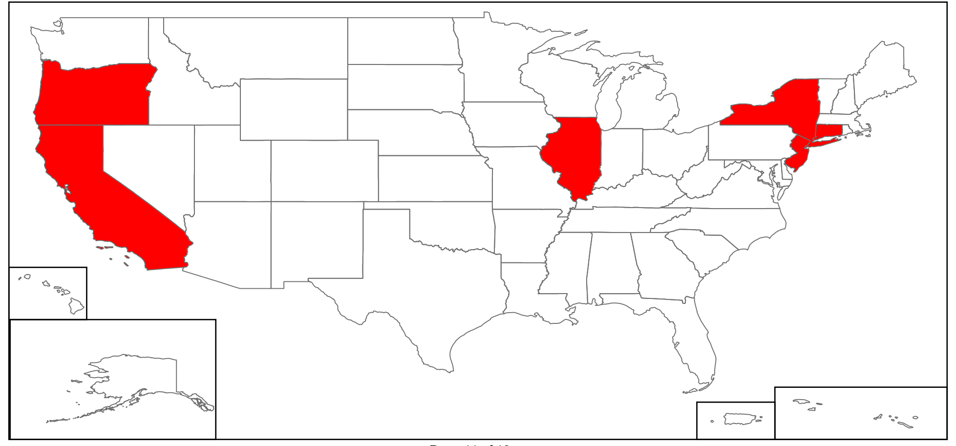
Page 11 of 13