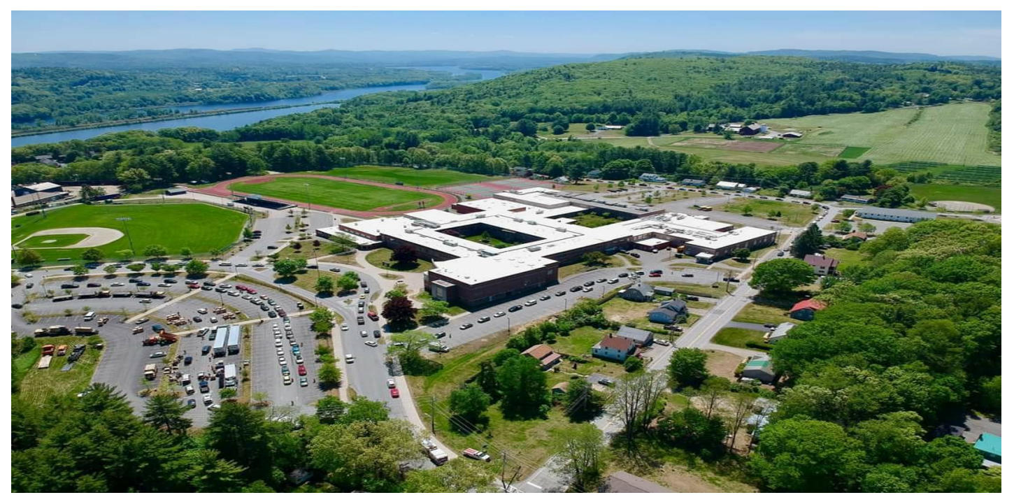
The May 27th food distribution at Brattleboro Union High School.