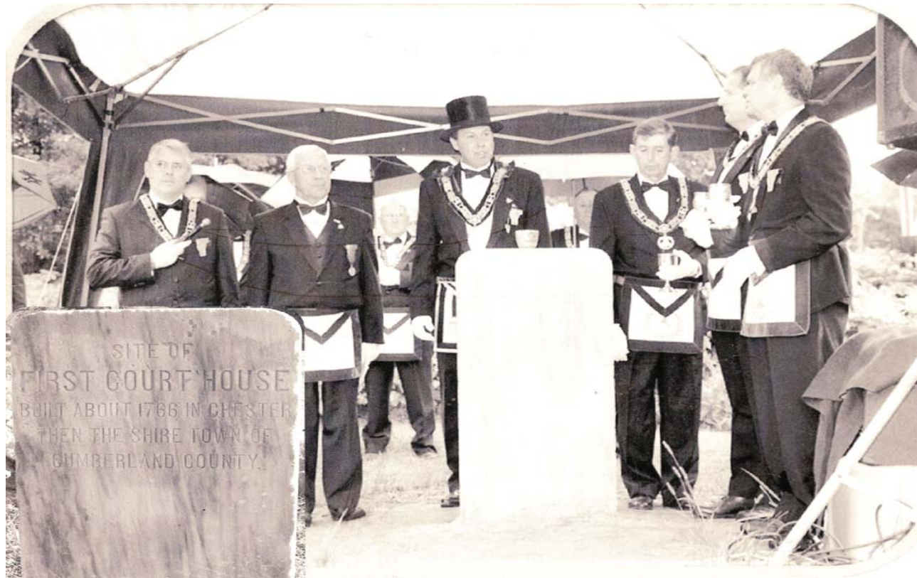
Rededication of the First Court House Monument which was moved back to its original site. Ceremony performed by State Masonic Officers at Founder's Day on August 29, 2009.