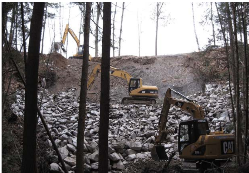
Repairing wash-out along Goldthwaite Road