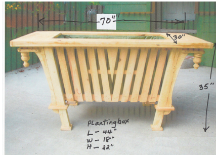
Victorian style: $225

Circle the style photo you are purchasing and mail a copy of this completed order form with your payment by Oct 1 to: Chester Townscape at PO Box 561, Chester, VT 05143.