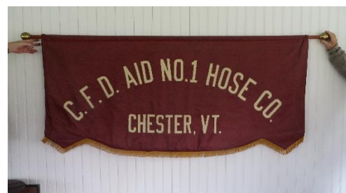
The Chester Fire Department recently delivered an old CFD banner to be displayed at the future Yosemite fire museum.